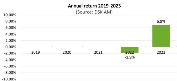
Return (in original currency, for OTP Funds in HUF) of the financial instruments, included in "DSK-OTP Premium Mix" portfolio

The results achieved in previous periods do not predict future returns. Investors should have in mind that returns may increase or decrease as a result of currency fluctuations