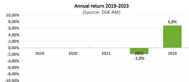
Return (in original currency, for OTP Funds in HUF) of the financial instruments, included in "DSK-OTP Premium Mix" portfolio

The results achieved in previous periods do not predict future returns. Investors should have in mind that returns may increase or decrease as a result of currency fluctuations