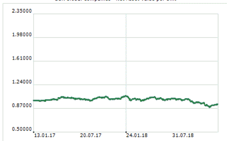
DSK Global Companies - Net Asset Value per Unit