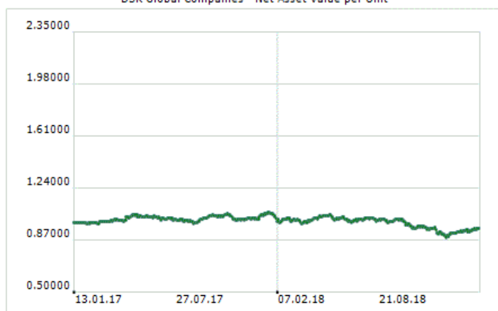
DSK Global Companies - Net Asset Value per Unit