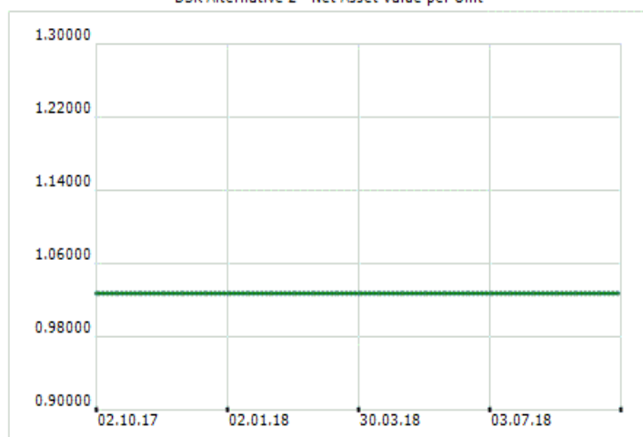
DSK Alternative 2 - Net Asset Value per Unit