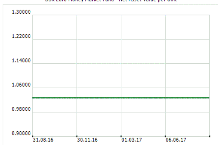
DSK Euro Money Market Fund - Net Asset Value per Unit