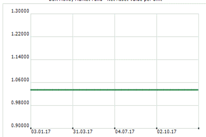
DSK Money Market Fund - Net Asset Value per Unit

At a request for redemption, the customer receives immediately 99% or 100% of the value of his/her units depending on the order type, while the remainder when 99% is delivered on the next business day.